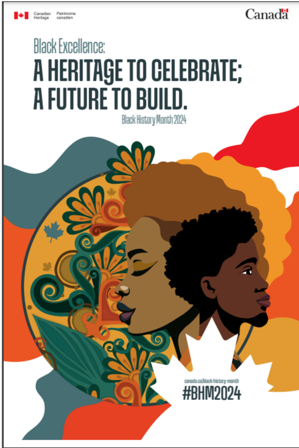
English poster featuring a colourful background made up of vibrant blue, orange, and red colours with floral detailing and two prominent faces at the forefront