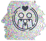
MSS Mental Health Resource

This is a mental health resource that will appear in the E-Bulletin weekly that was created by past and present Markville students.